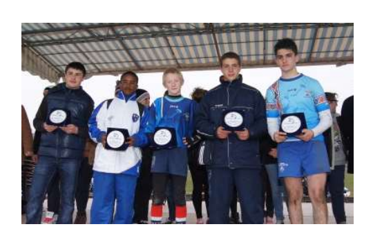
Each team will have a changing room. Each team will be rewarded

The two playing fields are on the same sports centre site. The number of teams in each class is limited to 10. Priority will be given to the first clubs to answer this invitation by sending their entry form.